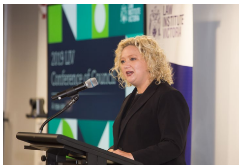
Victorian Attorney General, the Hon Jill Hennessey MP addresses the LIV Conference.

The conference was a great opportunity to meet with the above speakers, LIV Council members, regulators and legal association representatives.