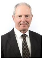
Keyran Pitt QC

The LPBT indicated that, when travel restrictions ease, we would be welcome to attend a Board meeting to discuss the UL scheme.